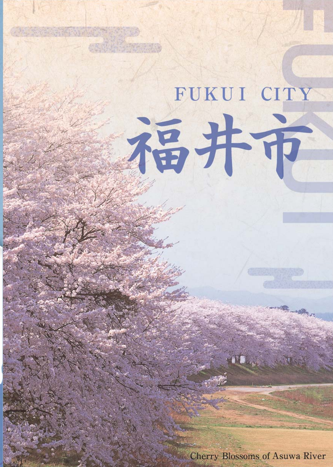
Cherry Blossoms of Asuwa River