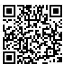
(Fukui City website : homepage)

→ http://www.city.fukui.lg.jp/foreign/english/p004763.html